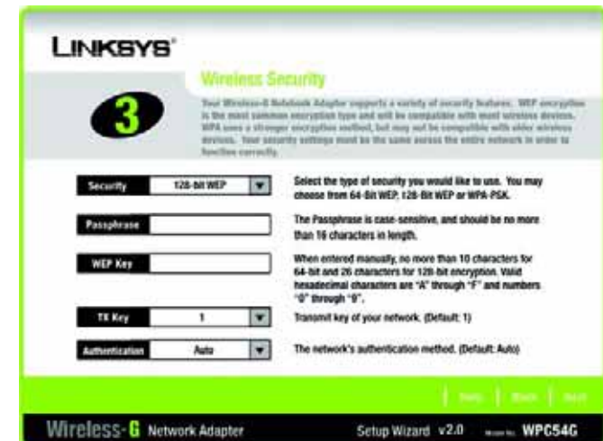
Figure 4-5: The Setup Wizard's WEP Screen